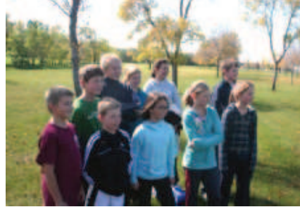
Grade 5-8 Cross Country Team

Extra-curricular sports are a huge draw for students of all ages. We were excited to have our first ever Grade 5-8 Cross Country Team compete in the Hanover School Division races this year. Three of our students finished in the top ten in their category, and qualified to compete in Winnipeg. Our Middle Years program also fielded three Volleyball and four Basketball teams in the Hanover School Division league. Each team competed in exhibition games and tournaments both at our school and at other venues. At this age, it is very exciting to see them learn and progress in their basic skills because of the extra games they play.