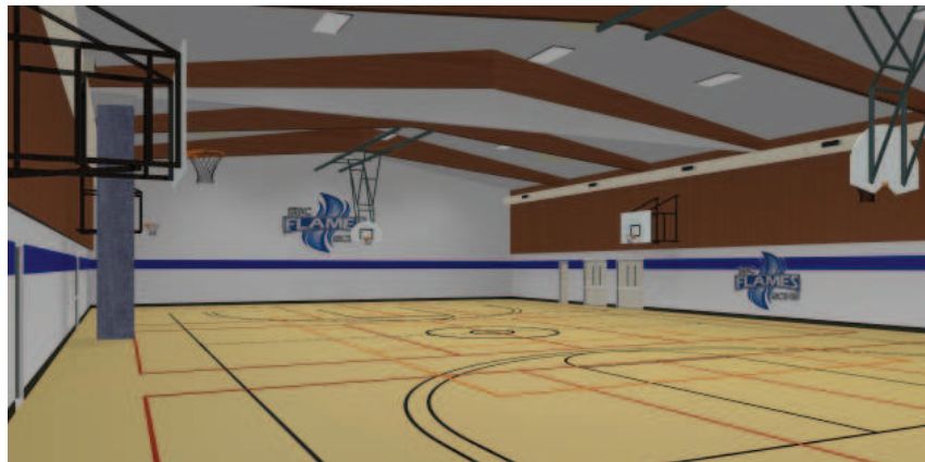
Conceptual drawing of gym upgrade

To deal with these issues, a gym renewal is planned.