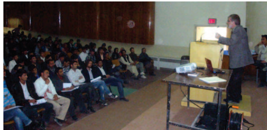
Lecturing at Kabul University

We have been blessed and sustained always. As a family we lived in Pakistan during the 9/11 crisis and the subsequent fall of the Taliban. As Afghan refugees flocked back to Afghanistan, we soon joined them. After two decades working with refugees and immigrants, we experienced four years of the challenge and privilege while living among Afghan citizens in Kabul. In Afghanistan we started a development project focussing on leadership training and publishing good books for children.