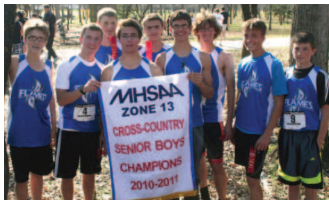
Senior Cross Country Team

We love to have SCHS grads get involved in our athletic program through coaching and refereeing. Steinbach Christian High School alumni are making a significant impact as they model excellence in teaching their sport and living out their Christian values from the sidelines. Great job coaches!